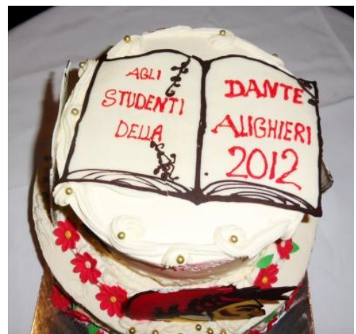
La bellissima torta per la cena del 23 novembre fatta dalla pasticceria “Maurita”