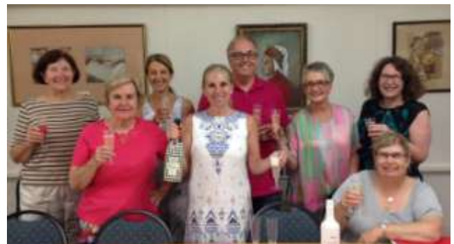
Intermediate Conversation Class – Monday morning