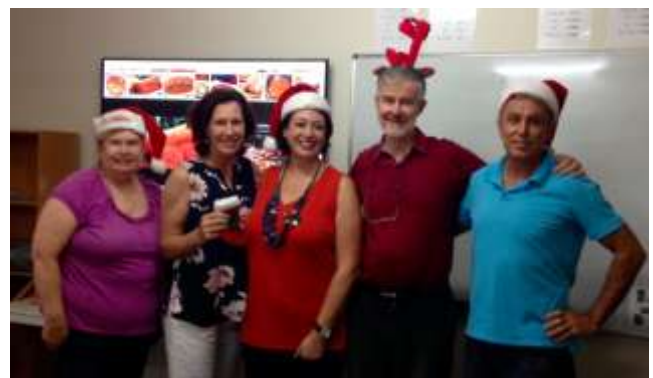
Adv 1 Class – Wednesday morning