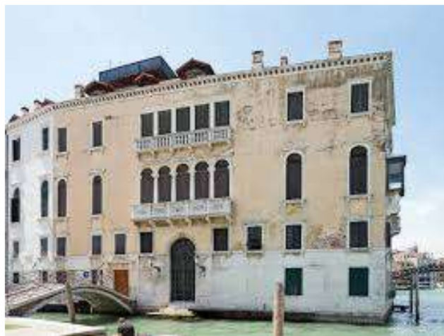
Palazzo Loredan Cini

Abbiamo fatto un giro in gondola lungo il Canal Grande. Improvvisamente ecco il Palazzo Loredan Cini, la casa dei miei ricordi e dei miei sogni! Com' era accaduto a tanti altri palazzi antichi di Venezia, gli anni non erano stati gentili. Ma la cosa piu' strana di tutto era una grande insegna al neon sul tetto. Che cosa era successo?