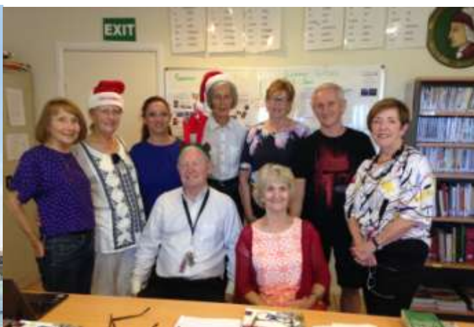
La classe Adv. 2 di mercoledì mattina