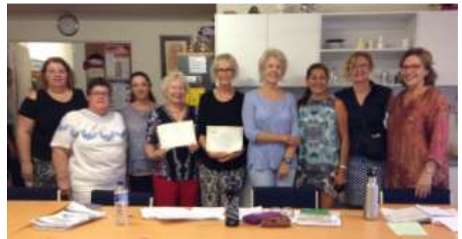
Intermediate Class – Monday morning